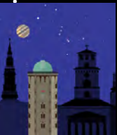
The Round Tower Observatory

Emma Sivell aka Sivellink https://www.facebook.com/Sivellink is an English born graphic designer working on a year long design project entitled "An icon a day" which comprises of daily graphic Copenhagen based illustrations. These icons are Emma's online sketchbook, and a "springboard" for limited edition Copenhagen posters and cards. Available from webshop - http://sivellink.dk/shop