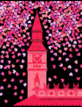
The Town Hall Wedding